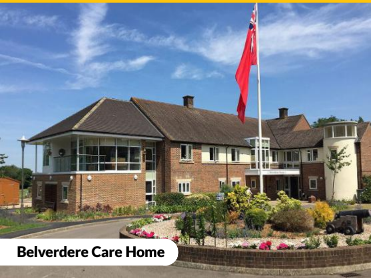
Belverdere Care Home

“I am very pleased with all of the information we now get from the system. Like being able to look back over the real temperatures on a chart from the past weeks means I can be sure that residents are always at the right temperature should anyone ask. I also like being able to see when the rooms are being used - this is really useful for the nursing side of things.”