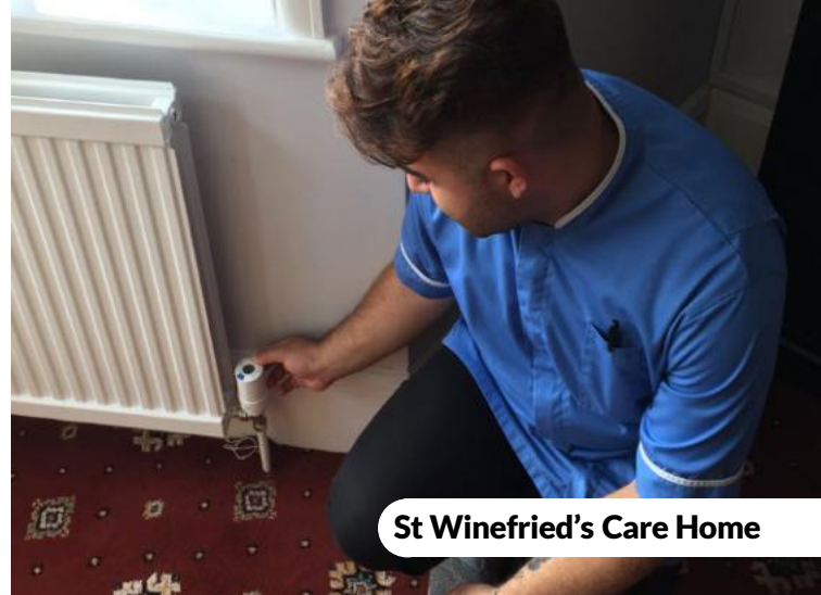
St Winefried's Care Home