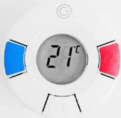
Genius Radiator Valve